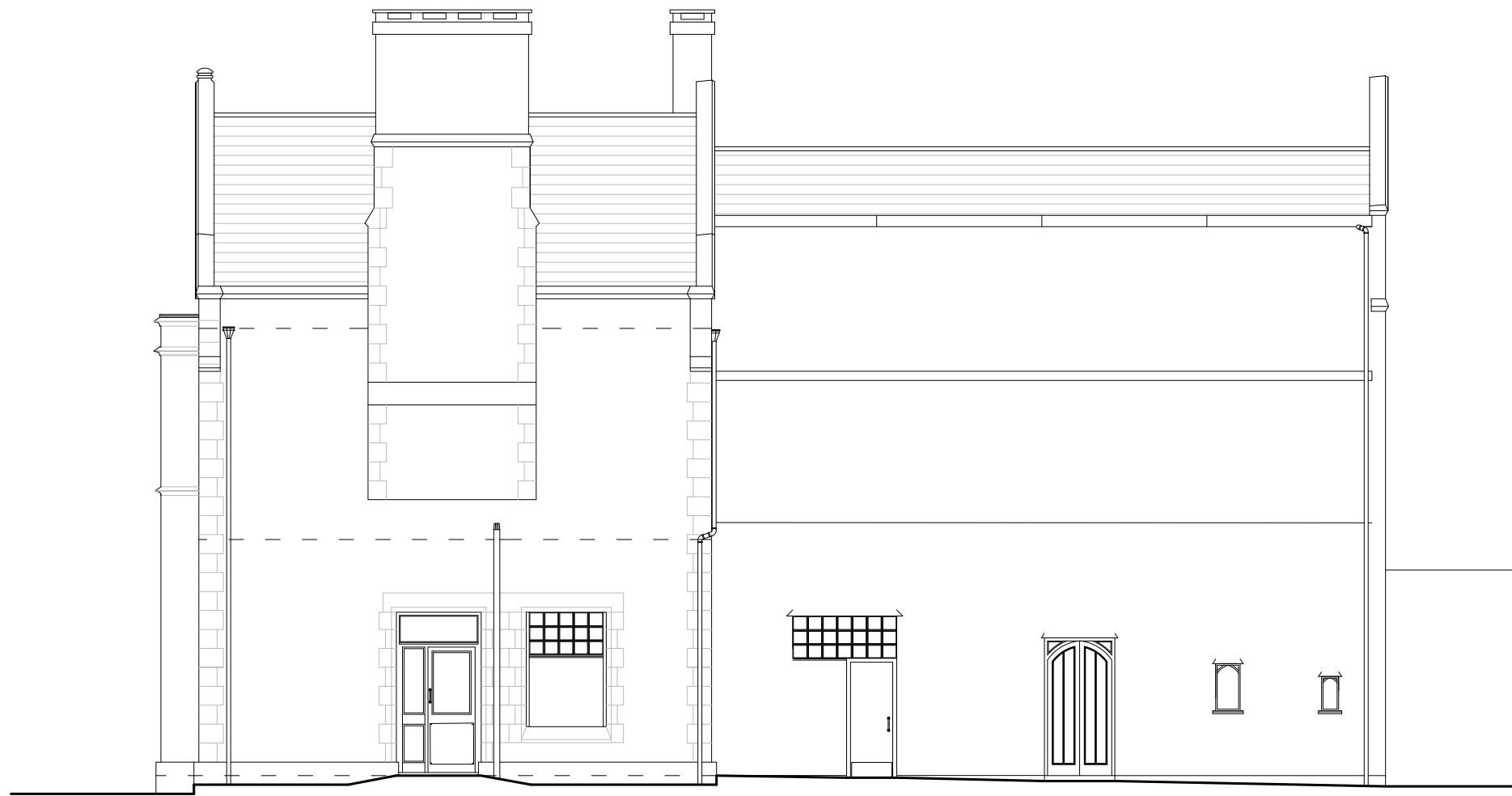
West Elevation Scale 1:100