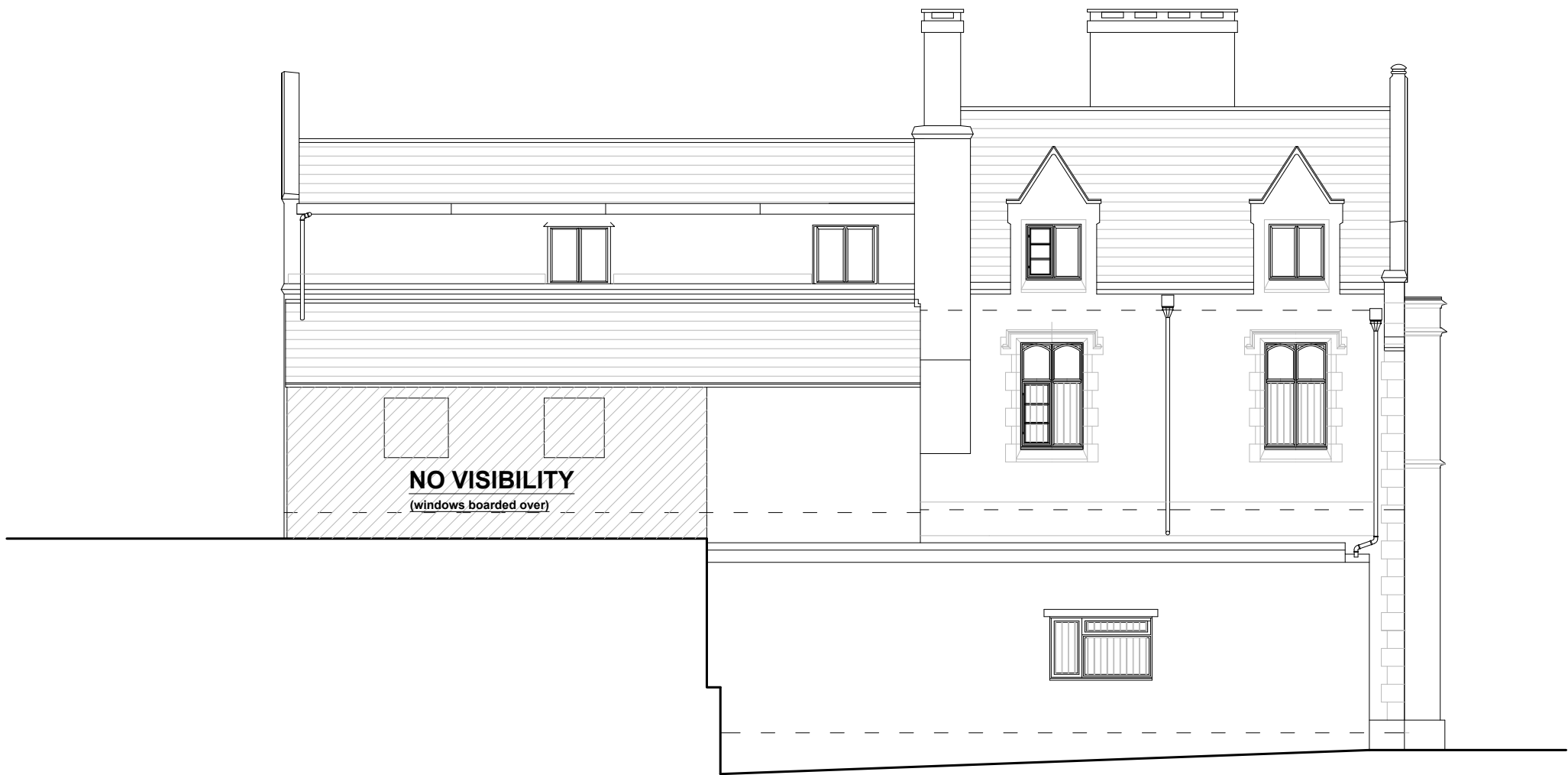
East Elevation Scale 1:100